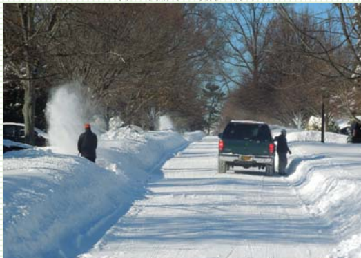
Bournedale Road North

We were supposed to get a few inches of snow on the fringe of a large storm, "...but the storm track could change." The last time we spoke to Cow Bay on Friday, January 23 rd , it was agreed that we needed to be prepared for "2 inches or 2 feet;" we got 29 inches. It took two days to dig out.