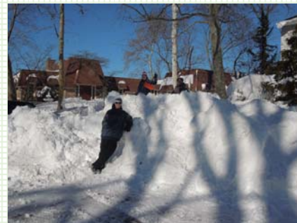
Above: Shore Road - Below: Plandome Pond Park