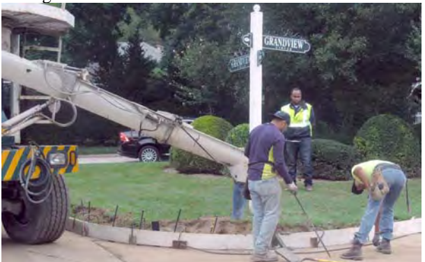
Concrete road work on Plandome Ct.