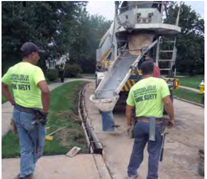
Curbs on Grandview